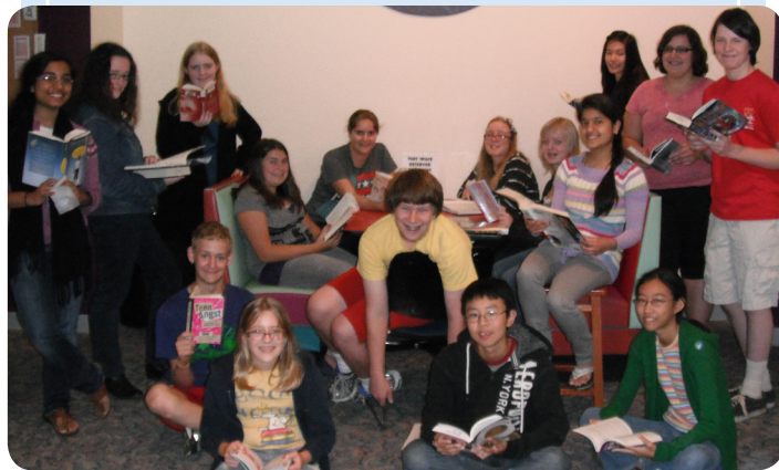
Ames Public Library Teen Advisory Group Nominated by: Ames Public Library