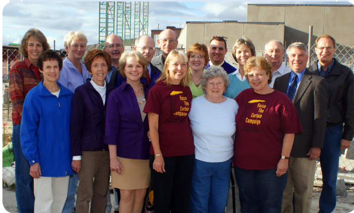
Josephine Tope Community Auditorium Capital Campaign Committee Nominated by: Nevada Community Schools